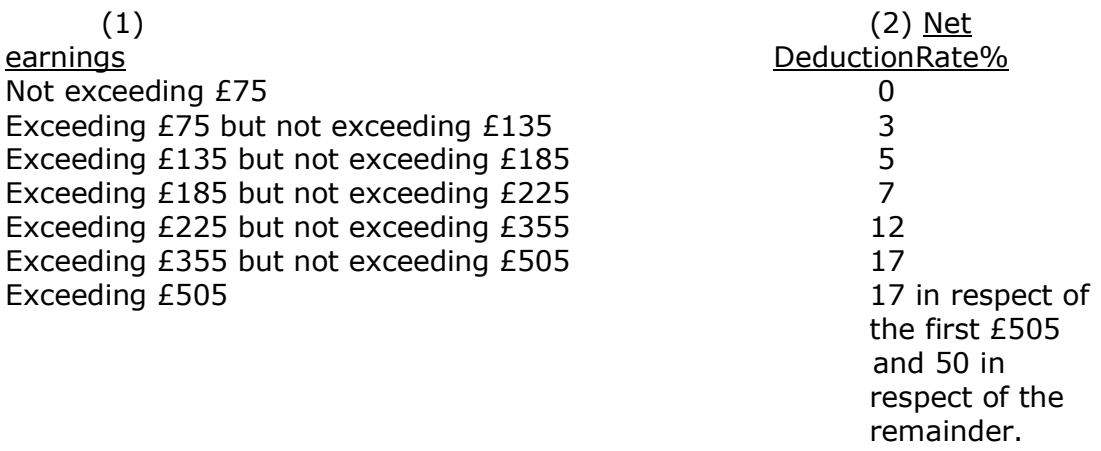
TABLE B DEDUCTIONS FROM MONTHLY EARNINGS