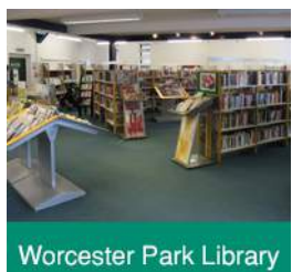
Worcester Park Library

Mollison Drive, Roundshaw, Wallington SM6 9NZ Telephone: 020 8770 4901 Email: phoenix.library@sutton.gov.uk