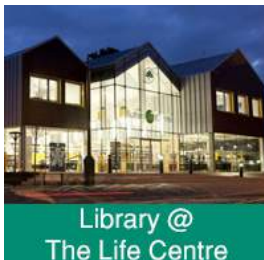
Library @ The Life Centre

Green Wrythe Lane, Carshalton SM5 1JJ Telephone: 020 8648 6608 Email: circle.library@sutton.gov.uk