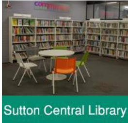
Sutton Central Library