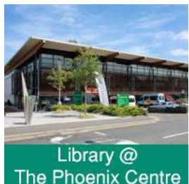
Library @ The Phoenix Centre

Alcorn Close, Sutton, SM3 9PX Telephone: 020 8644 9696 Email: lifecentre.library@sutton.gov.uk