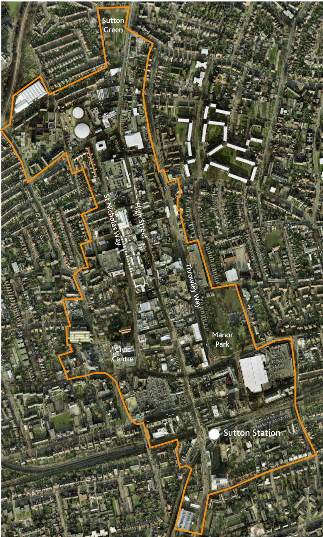
Fig A1: Sutton Town Centre - Study Area

Sutton Town Centre is one of the largest suburban centres in outer London and is classified as a Metropolitan Centre in the London Plan. It is the eighth largest centre in London with a total floorspace exceeding 400,000 sqm. The Study Area Boundary indicates the extent of the designated Town Centre and this Urban Design Framework.