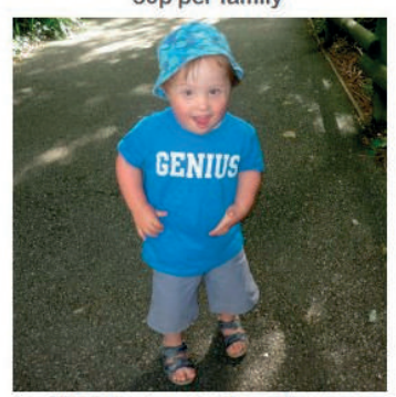
Wednesdays 9.30am to 11am

Cedar Lodge, 3 Metcalfe Avenue, Carshalton, SM5 4AW For more information contact getondowns@btinternet.com