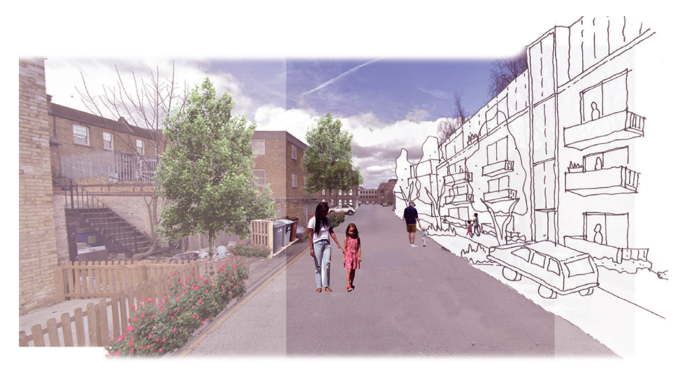
New buildings along Elm Grove and an improved street space

This option looks at retaining part of the Estate and demolishing parts of the Estate to build new additional high quality homes. Existing homes that are retained would receive the same level of refurbishment works as explained in the Refurbishment option. The partial redevelopment could also create additional homes through some rooftop extensions.