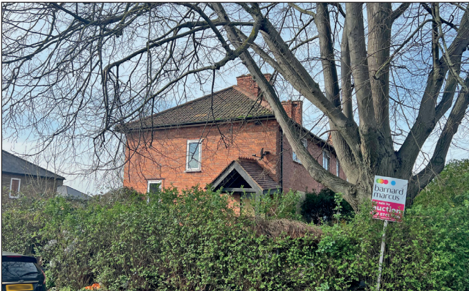
All enquiries Ref: Brian Grante