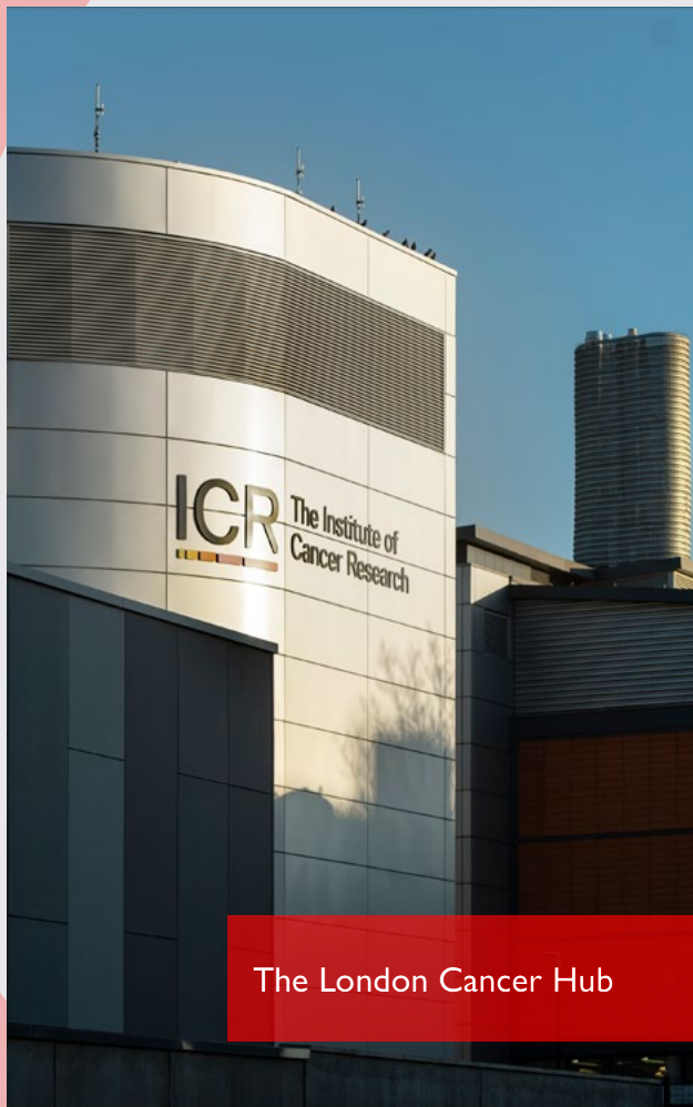
The London Cancer Hub