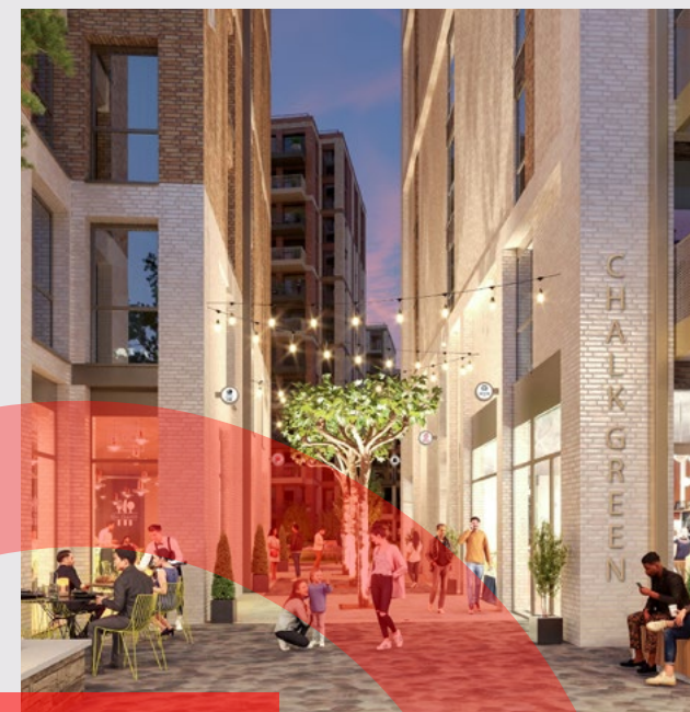
Chalk Gardens (CGI renderings)