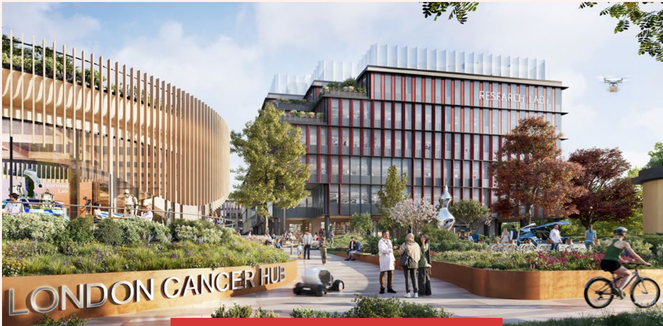
CGI renderings of The London Cancer Hub