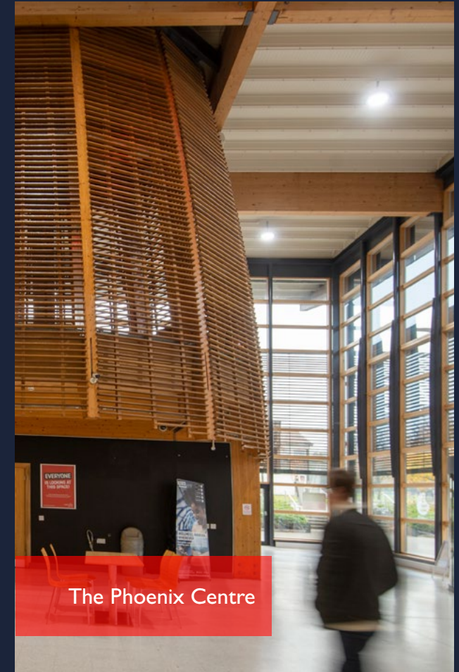
The Phoenix Centre