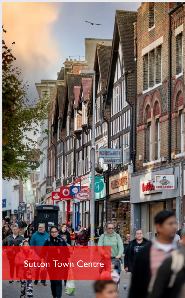
Sutton Town Centre

Sutton is an outstanding borough, with fantastic opportunities for businesses and investors. Located in South London, it benefits from both being part of London's economy and easy access to the South.